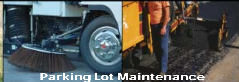
Parking Lot Maintenance